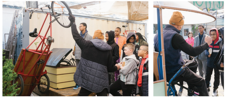
Young designers from Pratt Youth collaborated with BikePort for a sketching and prototyping workshop. Students were challenged to propose innovative pedal-powered solutions to urban problems of their choice.