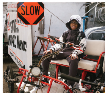
The projects varied widely, from a cooling station that doubles as an ice cream machine to a portable toilet trike, addressing the city's need for accessible facilities.